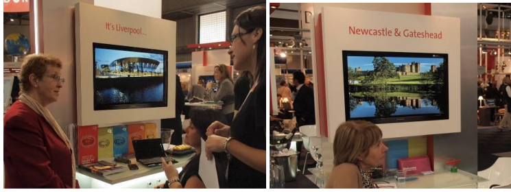
Images above show partner pods and plasma screen on VisitEngland stand.